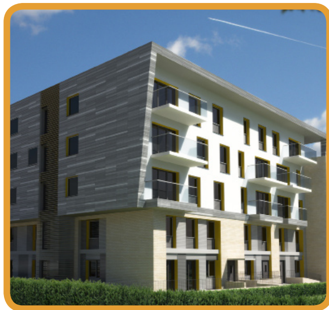
Site 1A Maybank Block

Demolition work on the Harrow Road site and the entrance to Roundtree Road will start soon, following the disconnection of all water, gas and electricity supplies.