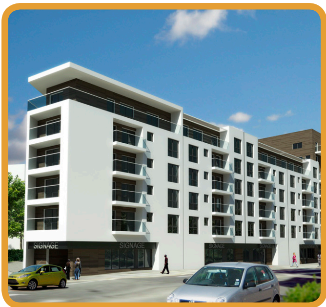
Site 1B Harrow Road