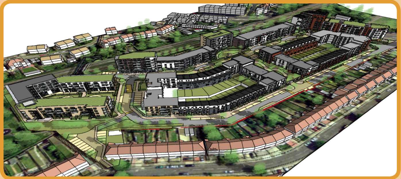
Artist's impression of the redevelopment

We will be holding an exhibition of the plans for the new homes in phases 2 and 3. Please come along to see the proposals for these phases at the: